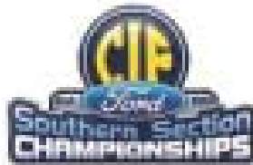
The Sponsor & Official Automobile of the CIF Southern Section - FORD Championships

Providing Support to Southern California's Student-Athletes