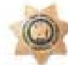
Supporting Partner of the CIF